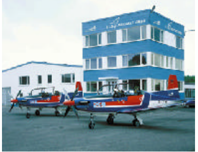
E.I.S. Aircraft GmbH

organizations and armed forces. From its headquarters at the airfield Dahlemer Binz / Eifel Mountains the company is running service stations at the airports in Munich, Kiel, Hamburg and Cuxhaven. The E.I.S. Aircraft GmbH is operating a fleet of 10 Pilatus PC-9B for tow target missions.